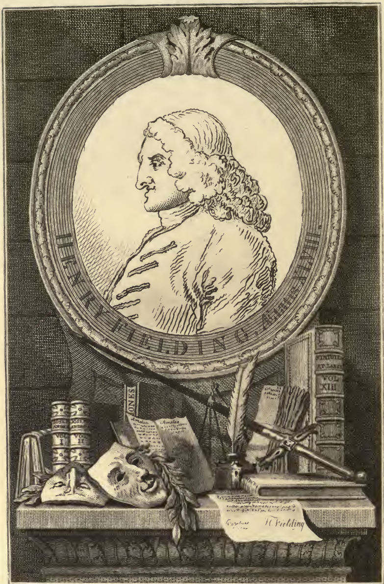
Henry Fielding From an engraving by James Basire after a sketch by Hogarth.